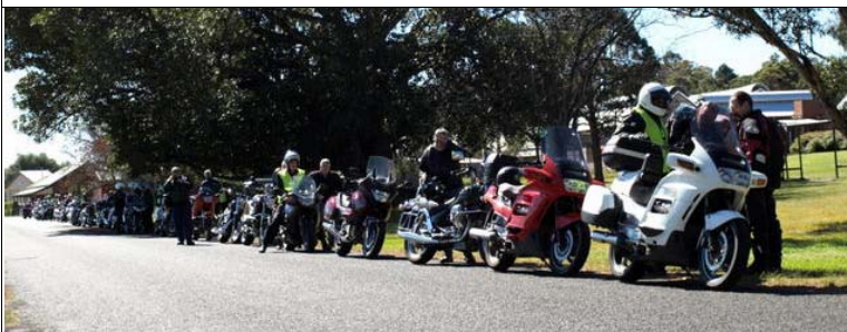
Lining up in Yarloop for the run into Harvey