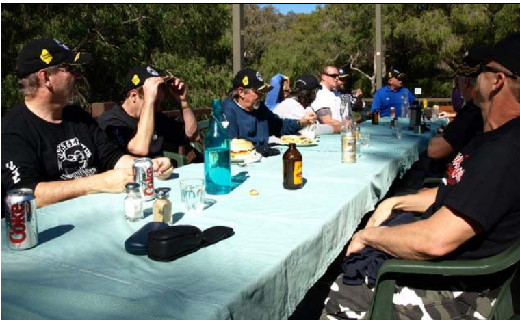
Chooks at the seed tray!

Earlier in the month we followed Mick Webb down some wind swept and interesting roads to Harvey where the ladies at the Heritage Café fed us well.