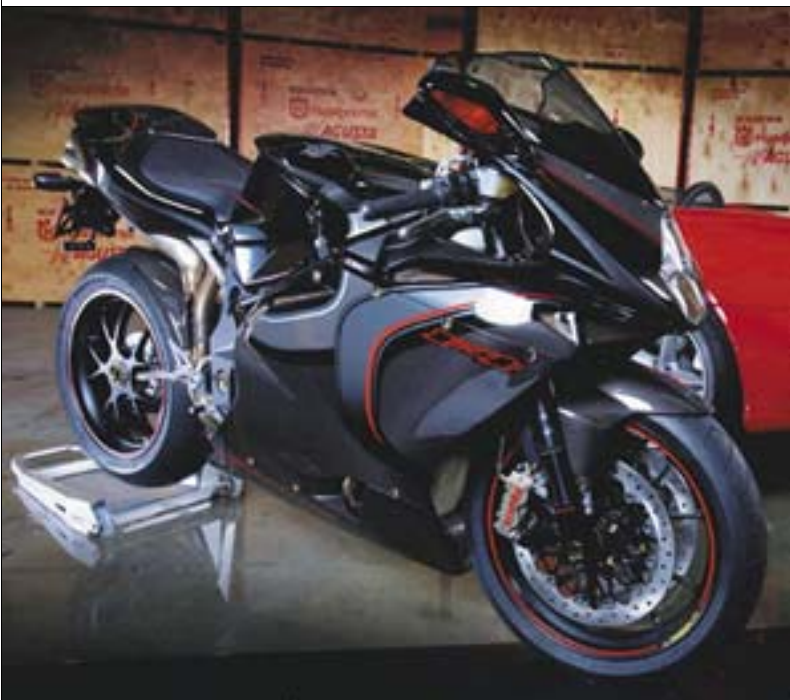
Agusta F4 motorcycle The CC version of the MV Agusta F4