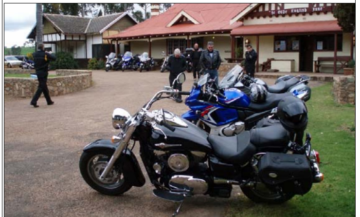
That's all folks!